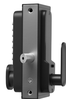
BDGS left hand version shown